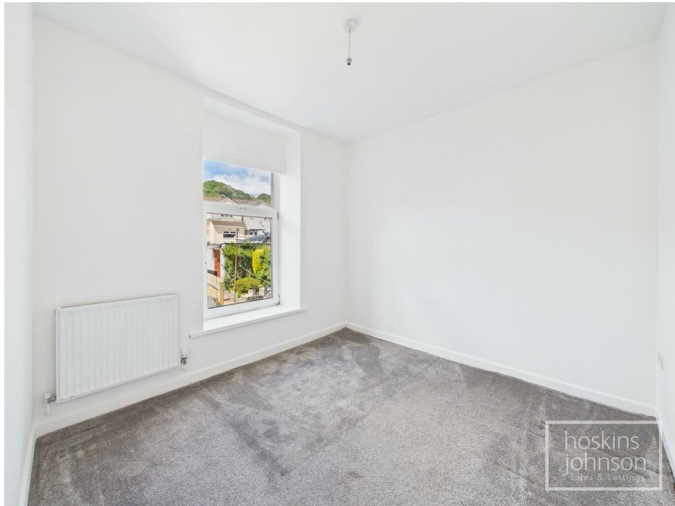
Double glazed window to rear, radiator.