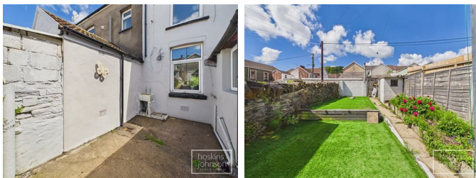
Small forecourt with artificial grass. Good size, sunny garden, again with artificial grass, flower beds and rear access.