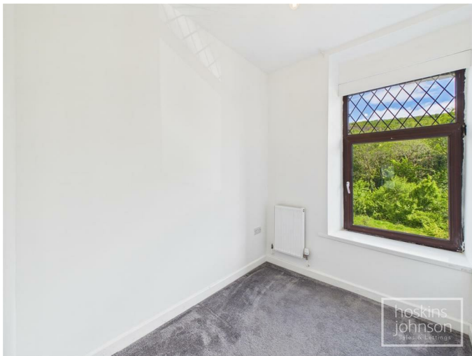
Double glazed window to front, radiator.